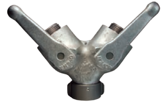
1" - 1½"