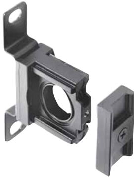
T Bracket w/Joiner Set GPA-96-603