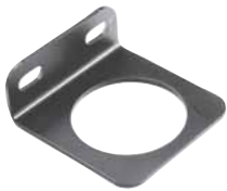
L Bracket GPA-96-606